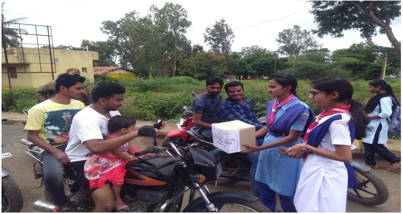
Kodagu Floods Compensation Fund Collecting by Our College Scouts and Guide Students