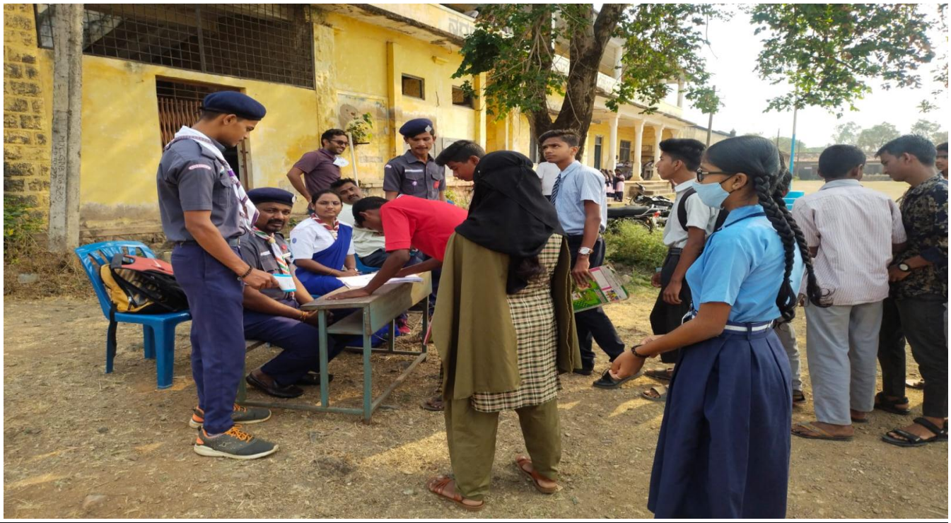
Service by Our College Scouts and Guide Students To All SSLC Board Exam @ Bailhongal