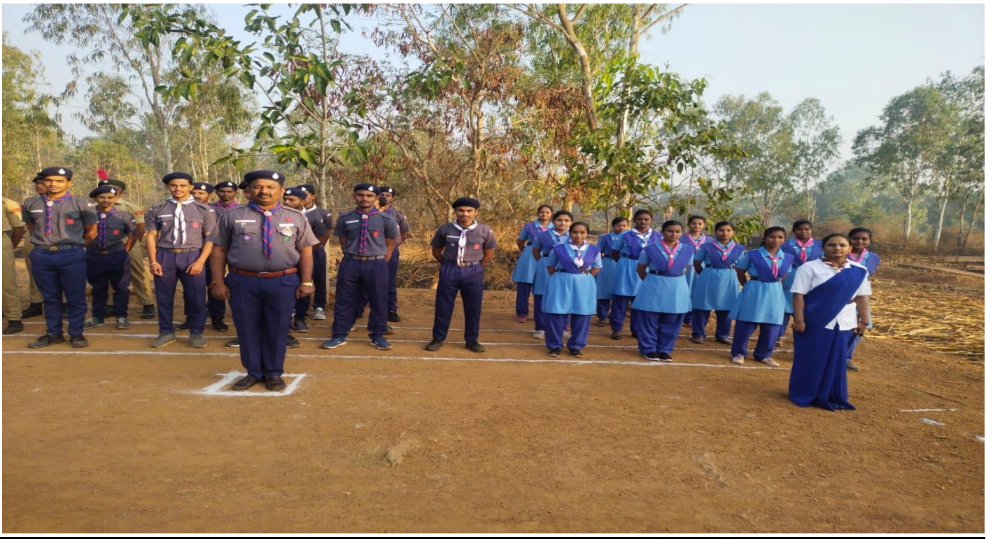
Scouts & Guide Students Attended to Celebrate Independence Day