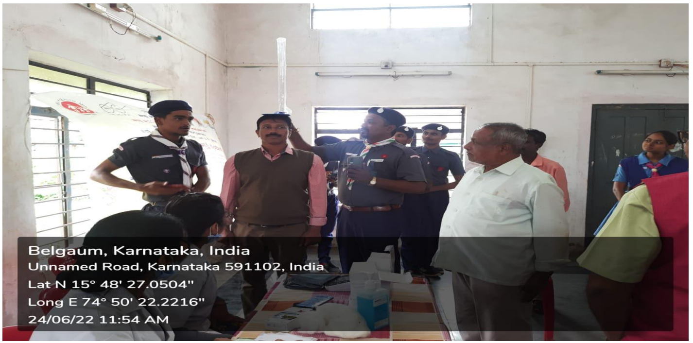
Conducted Free General Health Checkup Camp with collaboration of Govt. Hospital Bailhongal for Janata Colony villagers, Devalapur Road, Bailhongal