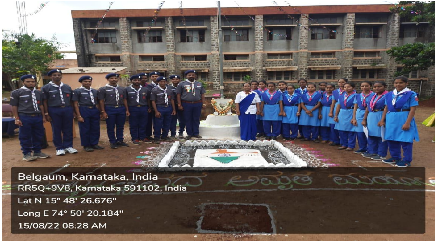
Independence Day Celebration @ Our College