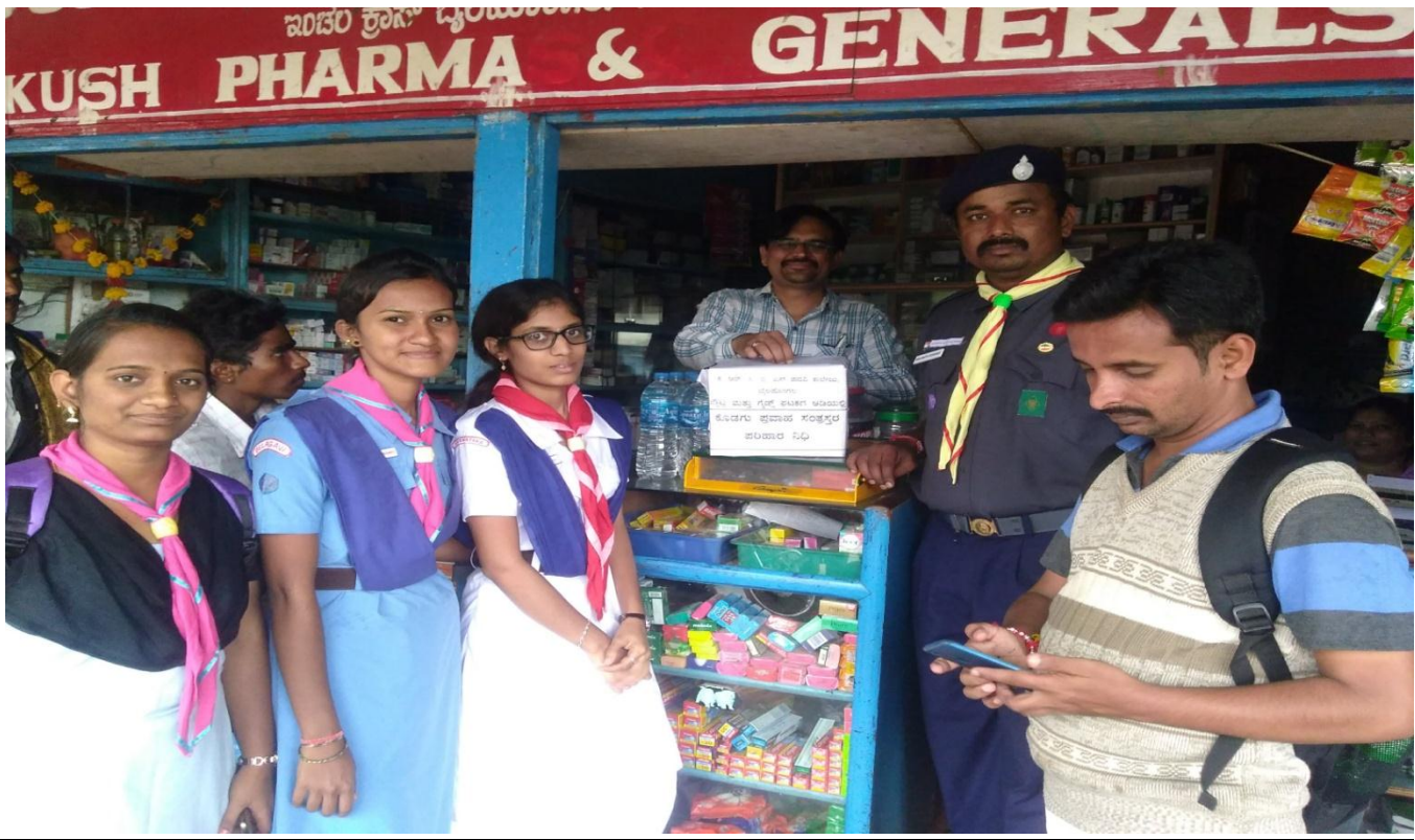
Kodagu Floods Compensation Fund Collecting by Our College Scouts and Guide Students