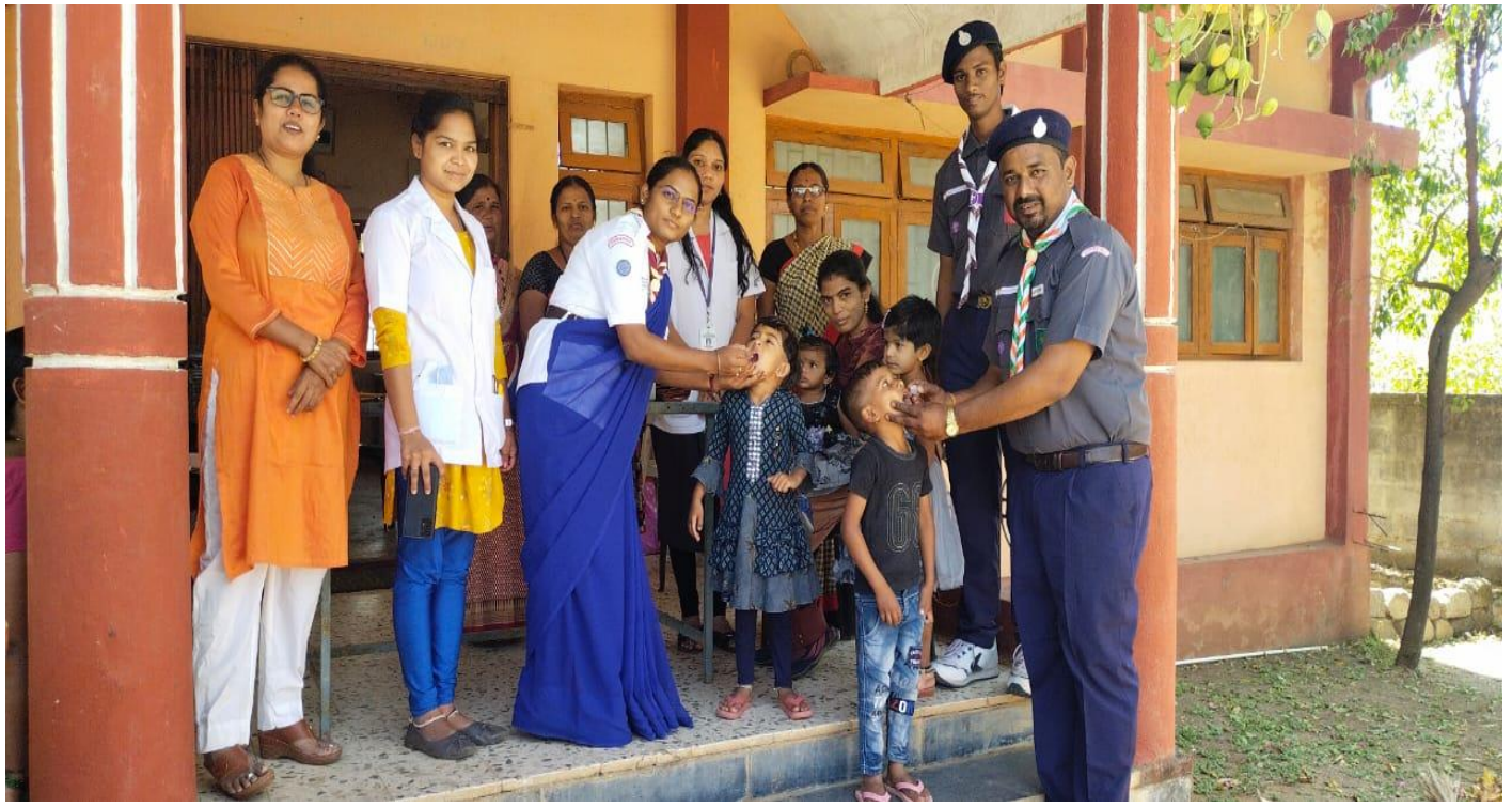
Service by Our Scouts & Guides Students to all Pulse Polio Booth @ Bailhongal