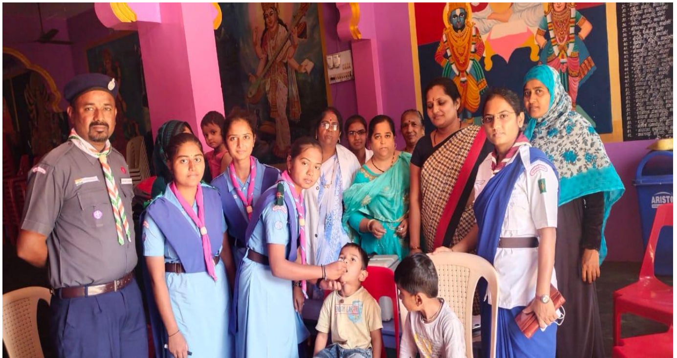
Service by Our Scouts & Guides Students to all Pulse Polio Booth @ Bailhongal