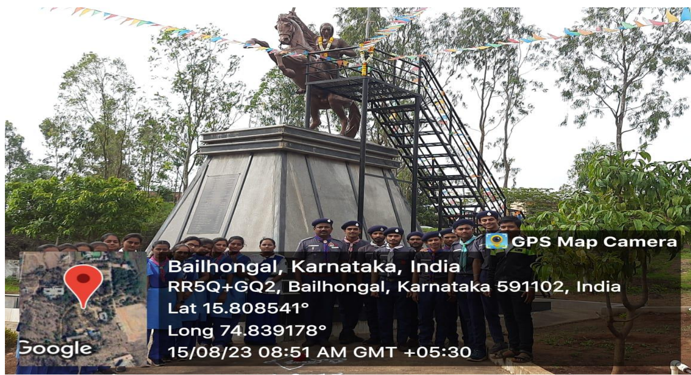
Cleaning Our College Campus by Our College Scouts & Guide Students