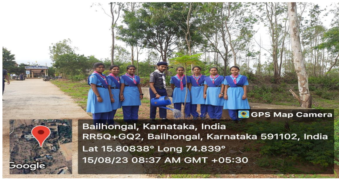
Tree Plantation at Our College Campus by Our Scouts & Guide