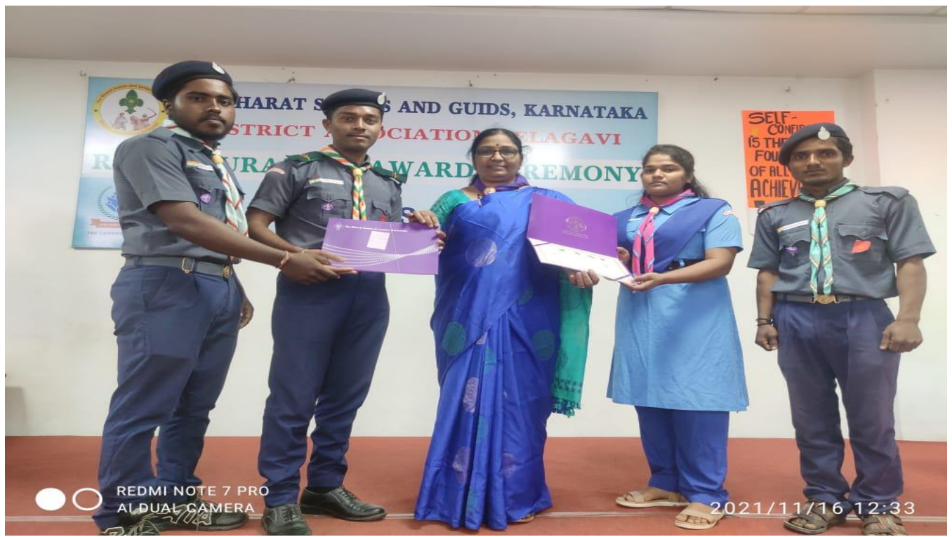
Rajya Purskar Award Winners