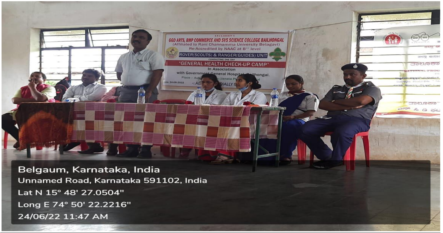
Conducted Free General Health Check-up Camp with collaboration of Govt. Hospital Bailhongal for Janata Colony villagers, Devalapur Road, Bailhongal