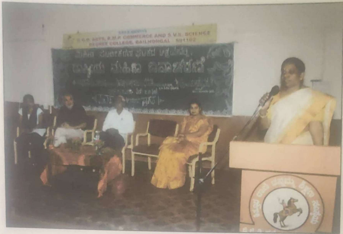
Members of Women's Empowerment Cell.